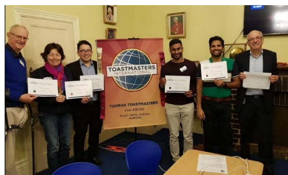
Our President presented certificates to the recently completed Levels of our terrific Toorak Toastmasters members